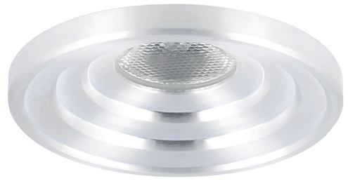
Art. no. 50258860