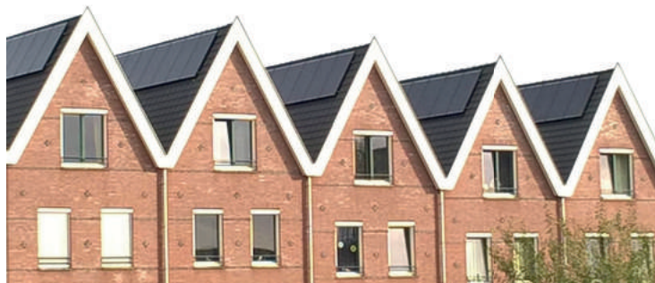
Speedy calculation, speedy order picking and speedy mounting

A list of articles is delivered immediately to your inbox, so you can order the materials directly from your wholesaler. The planner is available in seven languages. Would you like to try it yourself? Go to www.valkboxplanner.nl .