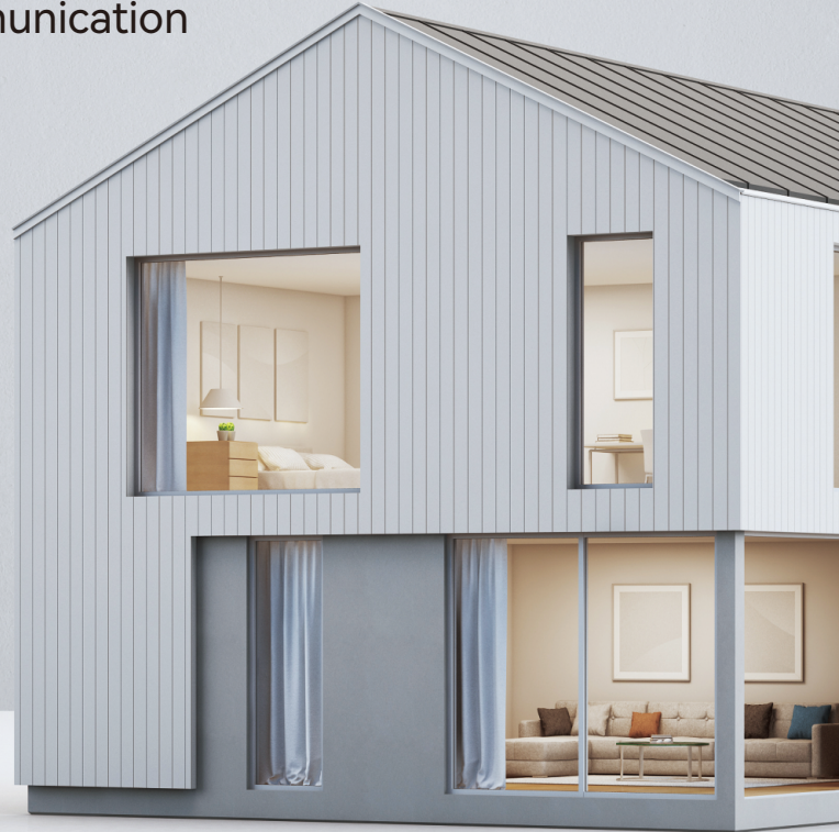
GroHome System Diagram